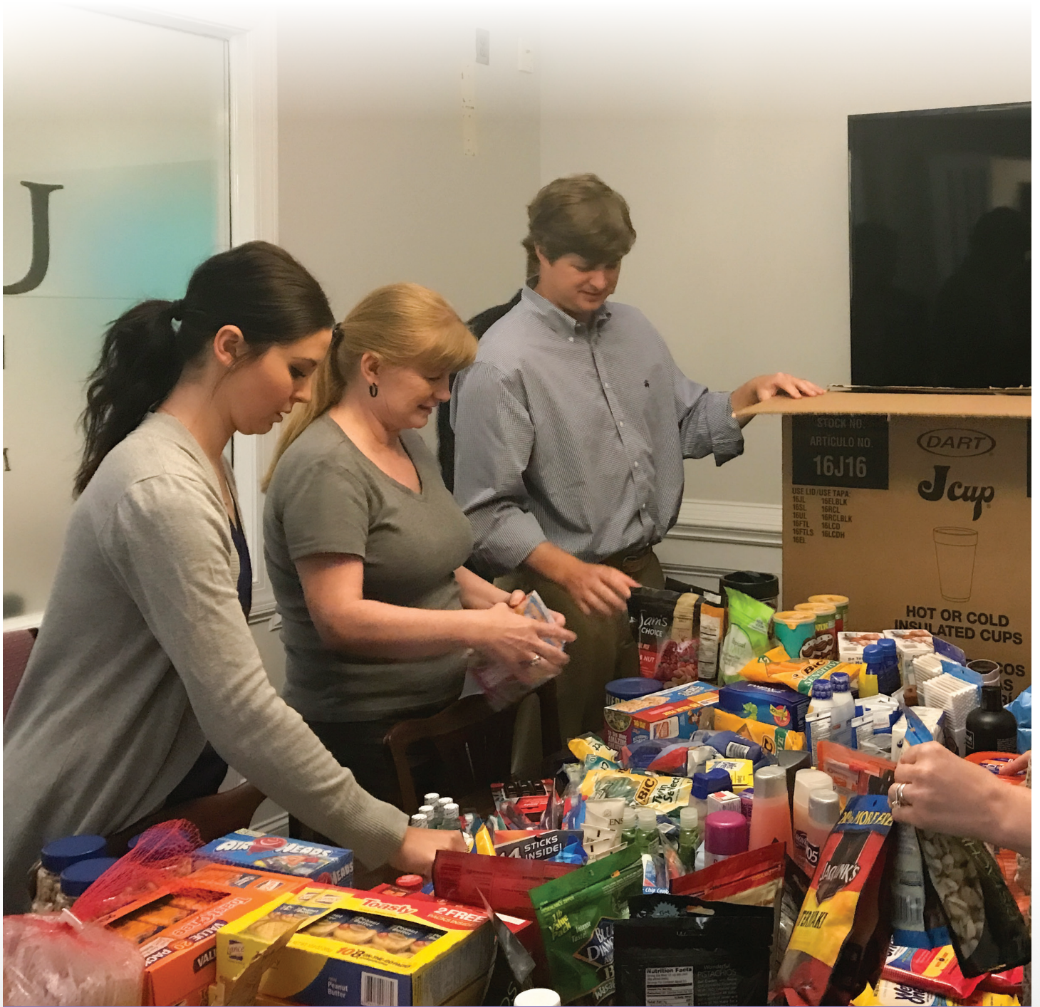
Associates gather non-perishables and supplies for our military troops.