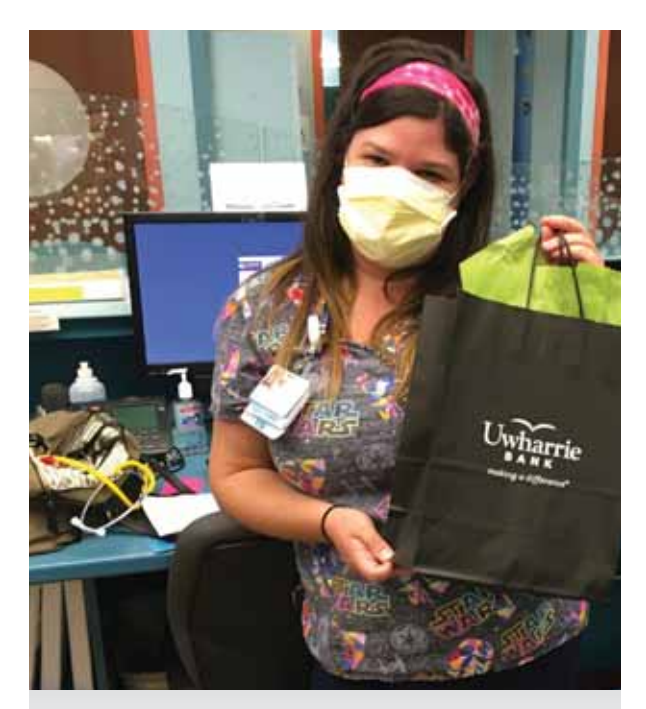
During the pandemic, care packages and snacks were delivered to numerous healthcare facilities for staff and personnel.