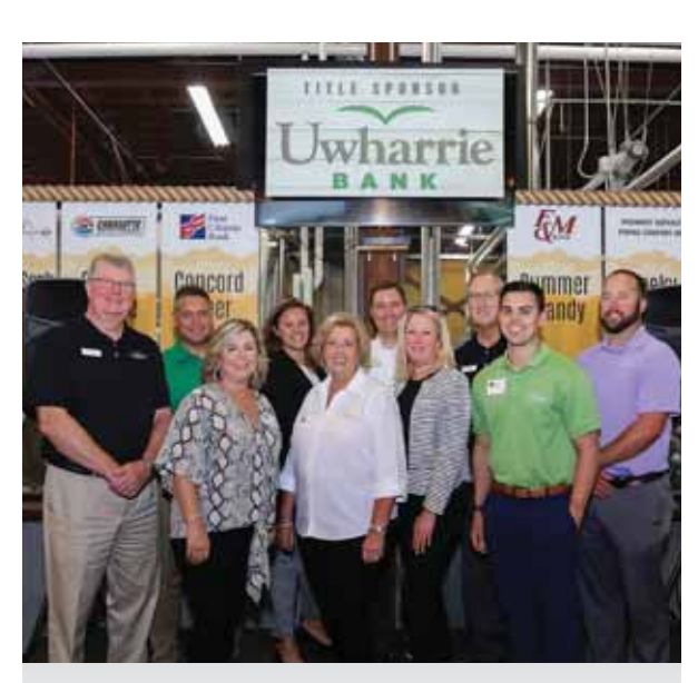
Uwharrie Associates support local businesses and events. It's a tradition for Cabarrus Brewing Company and Uwharrie Bank to co-host the Chamber's annual Brew N Cue networking event.