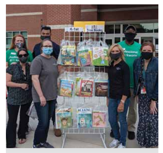
Our Rea Road office participated in a book drive at Montclaire Elementary School in Charlotte supporting non-profit, Promising Pages.

As the past two years have shown, our team of associates lives our Mission and Purpose every day in delivering for our customers and communities. We remain focused on ensuring associates feel supported, trusted and engaged, while creating opportunities to learn and innovate. As we adapt to an everchanging world of work and a competitive talent landscape, we'll continue to enable an inclusive culture as we attract, inspire and grow talent to continue our promise of Making a Difference in the communities we serve.