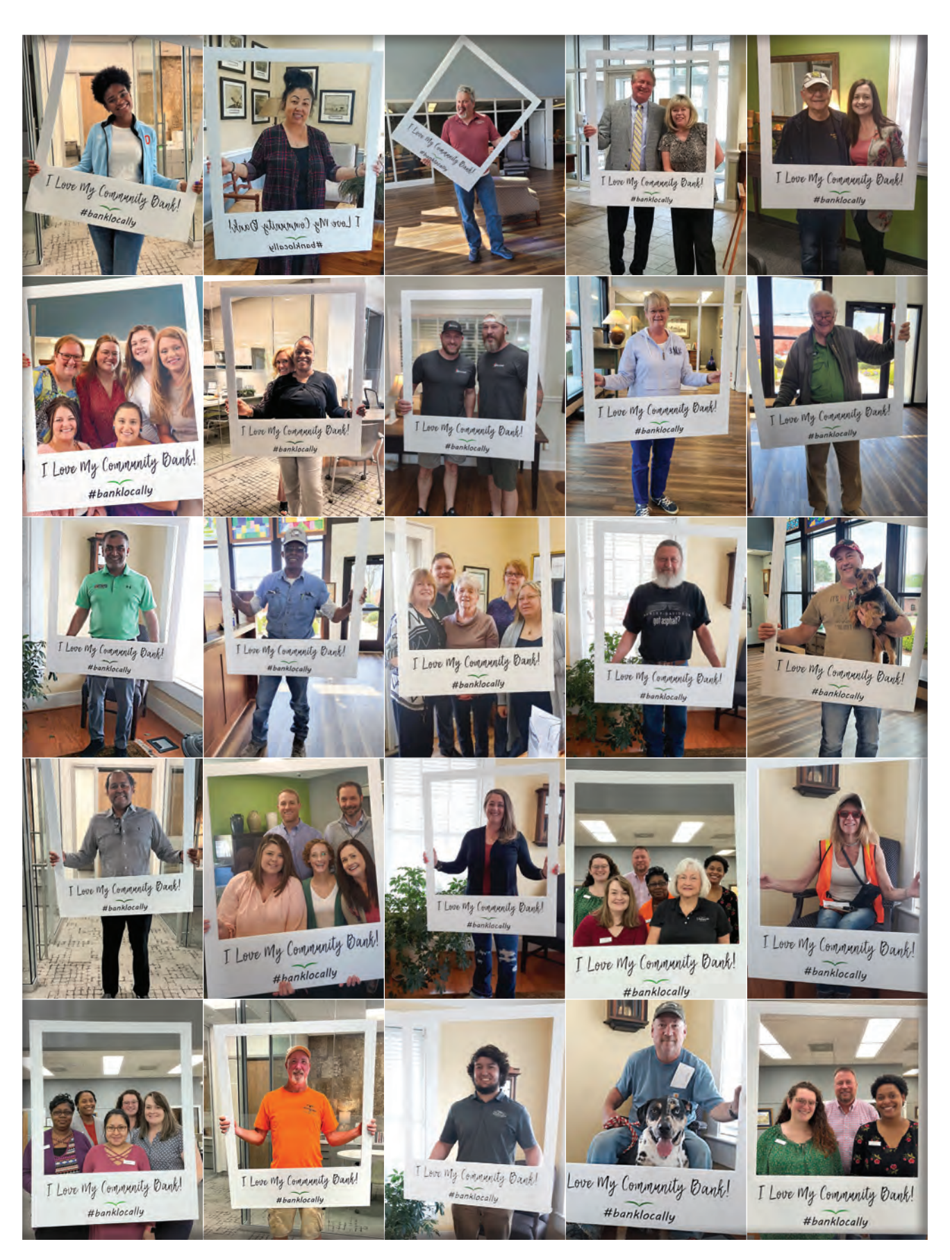
I Love My Community Bank!